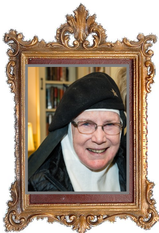
Mother Dolores Hart, O.S.B. Regina Laudis Abbey

Numerous individuals assisted in making the Gala the success that it was. Table Sponsors purchased Diamond, Gold and Silver Tables for their guests, vendors and Chelsea neighborhood businesses placed advertisements in the event's Program Journal, and various donors reached out and gave generously. The Leo House is grateful to all.